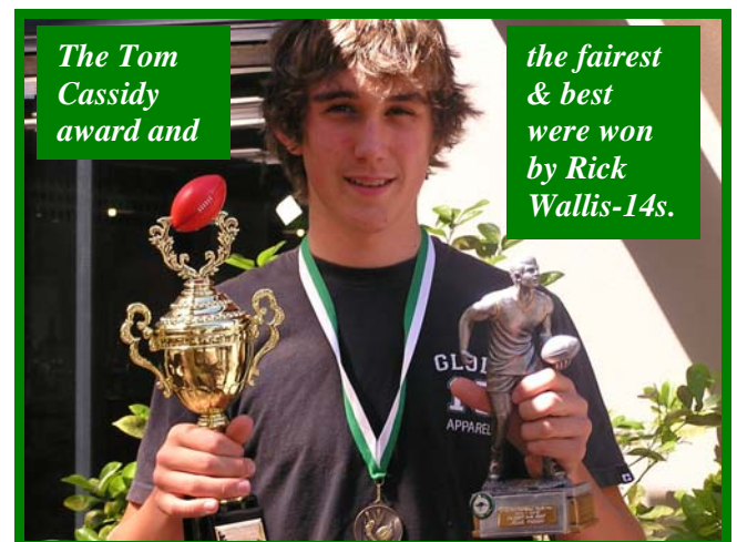
The Tom Cassidy award and